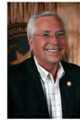
Principal Chief Bill John Baker